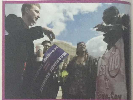
SOURCE 2: Supporters and opponents strongly disagree about whether same-sex marriage should be legal. However, both would likely agree that the legalization of same-sex marriage is politically significant.

Using decision criteria is one way to help analyze the political significance of an issue, policy, or event. You may want to consider all of the criteria given below, or you may decide that some are more important to you than others. You may also have other criteria to add.