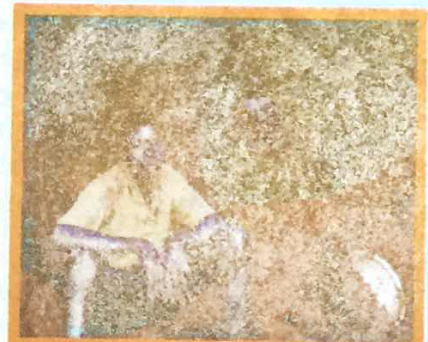
SOURCE 5: Some corporations use child labour to make cellphones more profitable. Should they be allowed to sell their phones in Canada?

Q1 Should we use the same standards of good global citizenship for people, nations, and corporations? Why or why not?