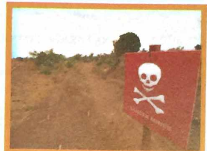
SOURCE 4: In 1996, Canada led the movement to ban anti-personnel land mines around the world. Why do you think Canada would get involved in this issue?