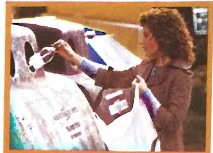
SOURCE 3: Even small actions can have a global impact. What do you do to be a good global citizen?